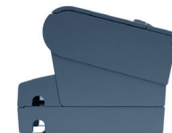
Power supply case fits under printer without increasing footprint size.